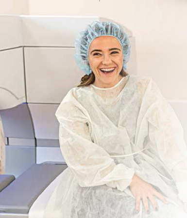
PROMO / October